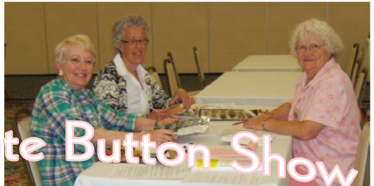
California State Button Show