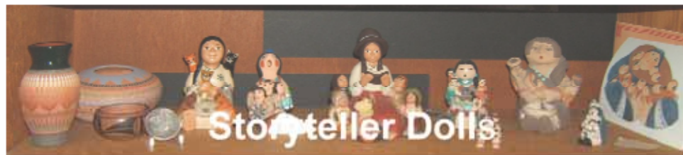
Story teller Dolls